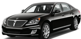
Hyundai Centennial (Limousine)